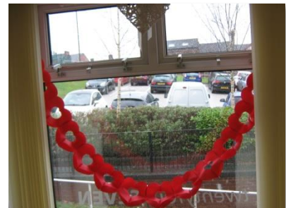
A Garland of Hearts

24/7 was decorated to celebrate Positive Memories Day by the 24/7 art group. Garlands and fireplace decorations gave the room a celebratory look and feel.