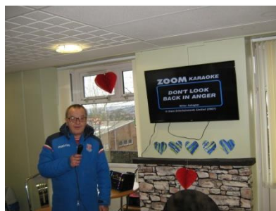
Phil Performing Karaoke

Leah provided a nail bar and had many customers throughout the day including the Newsletter's roving reporter Gary as seen in the main picture.