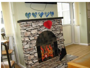
A Warm Fireplace!

Leah provided a nail bar and had many customers throughout the day including the Newsletter's roving reporter Gary as seen in the main picture.