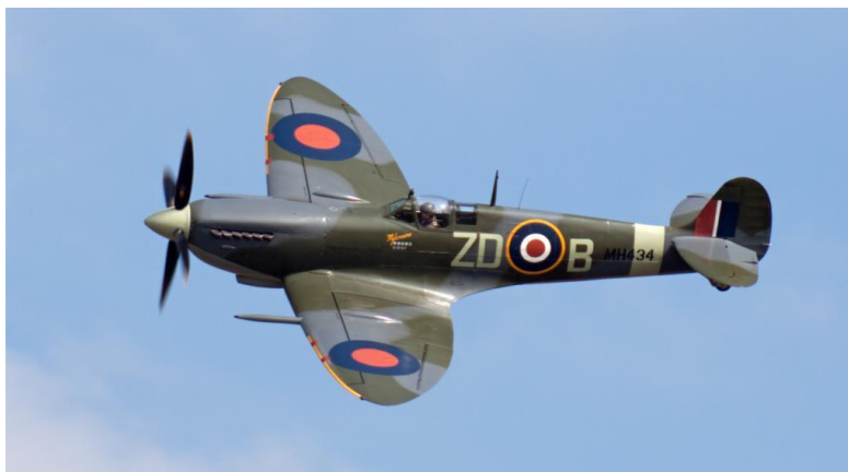
The Spitfire's graceful lines cut through the sky

R eginald Joseph Mitchell was born on the 20 th May 1895 at 115, Congleton Road, Butt Lane in Kidsgrove.