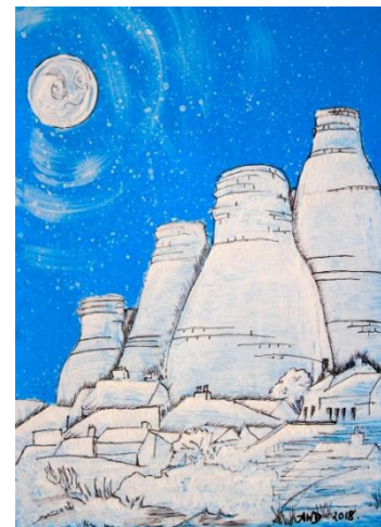
Christmas in Stoke

This Month in the Clubhouse Calendar: December