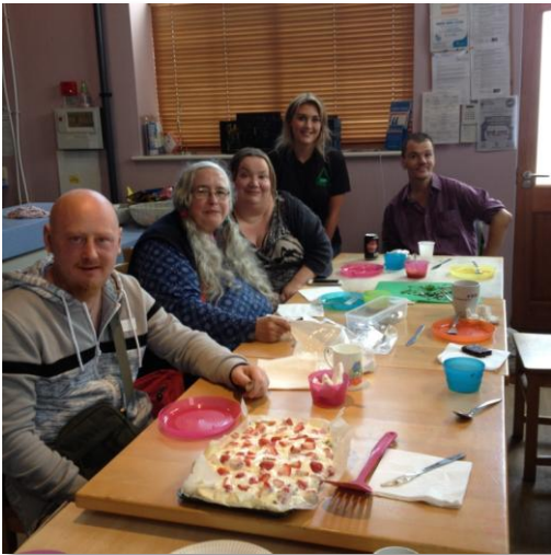
Everyone waiting for a pizza the action

The Cook & Eat was a huge success and everybody really enjoyed it and got so much out of it. Every single person prepared and cooked a starter, main and desert and then all sat afterwards and had a dish of each. Every one said they wished it was longer than 6 weeks!!!!