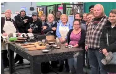
The metal workshop was very popular

Fifteen service users attended a metal workshop at Staffordshire University.