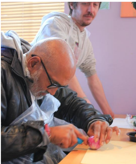
Bash and Dean precision chopping